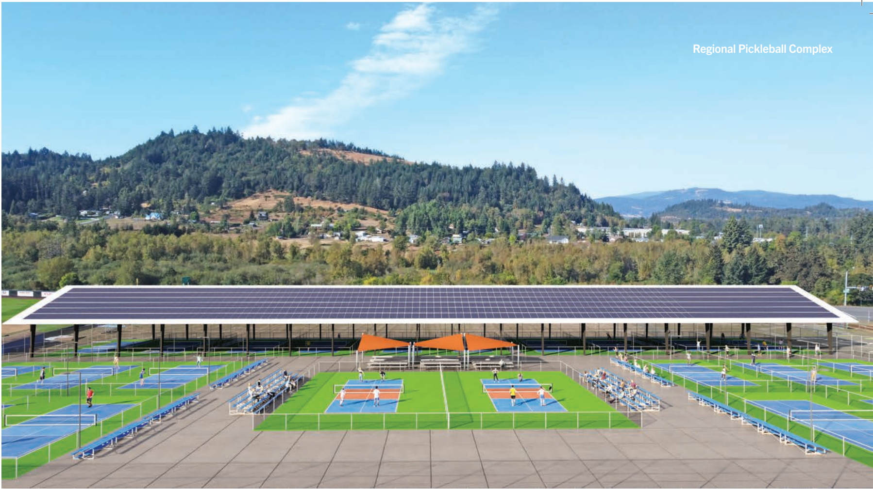
Regional Pickleball Complex

The Regional Pickleball Complex at Lane Community College is a $5 million project and when completed, will be the largest pickleball complex in the Pacific Northwest. There will be 24 courts, including two (2) championship courts that will enable the Club to host local and regional tournaments. At least ten of the courts will be lighted and covered so that pickleball can be played during the evening and our local rainy season.